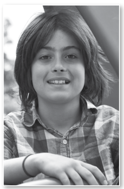
Nurturing a Child's Potential

The NH Charitable Foundation, through its Lakes Region Division, has awarded a Community Impact Grant to the Foundation to support an aggressive capacity-building enrollment and marketing initiative that will introduce or reintroduce Spaulding to an array of providers and school districts with a goal of increasing services to 36 additional students, bringing Spaulding's school capacity to 100. The $20,000 grant is the maximum amount awarded for a regional impact project, demonstrating the critical value of Spaulding's mission within the Lakes Region and beyond.