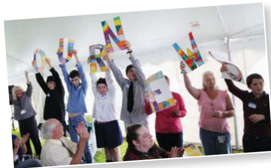
The celebratory program began with student chants: "Our New School is Cool!"

"FOLKS, THIS IS WHAT SUCCESS LOOKS LIKE!"