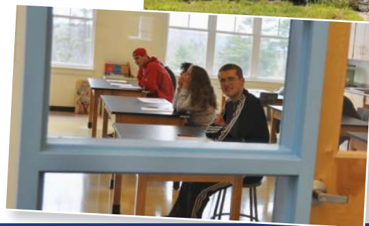
Windows to educational excellence.

OUR MISSION: Spaulding Youth Center is dedicated to improving and enriching the lives of emotionally and/or intellectually challenged children, youth and their families.