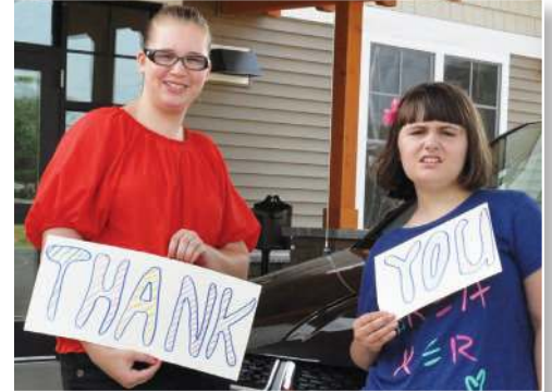
Students appreciate their new school

...this is a critical project which responds to a pressing societal need.